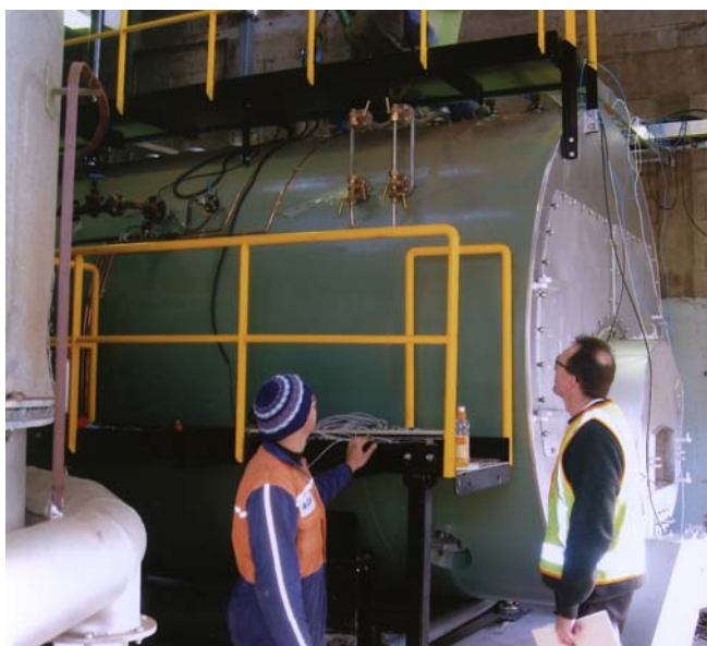
3MW Wood Fired Boiler – Gunns Veneers