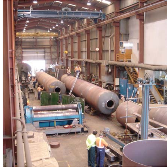
Air receivers – Black Point irrigation scheme