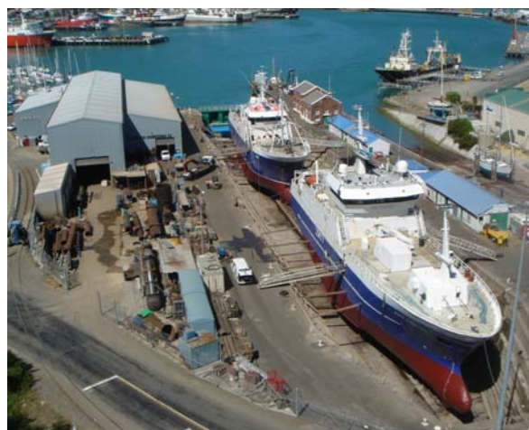
Janus & Avro Chieftain – Lyttelton dry dock