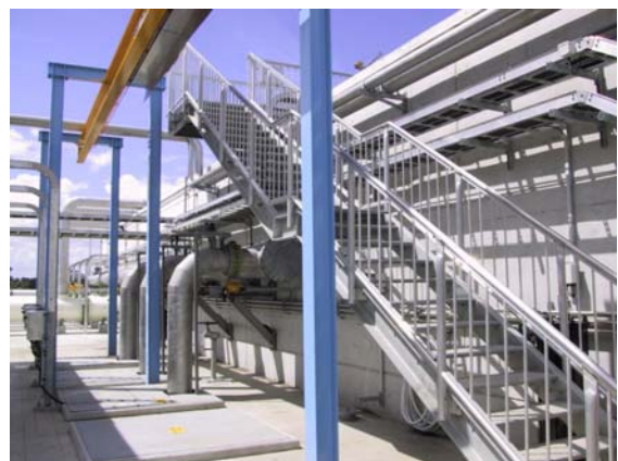
Guardway stairs – Manukau waste water plant