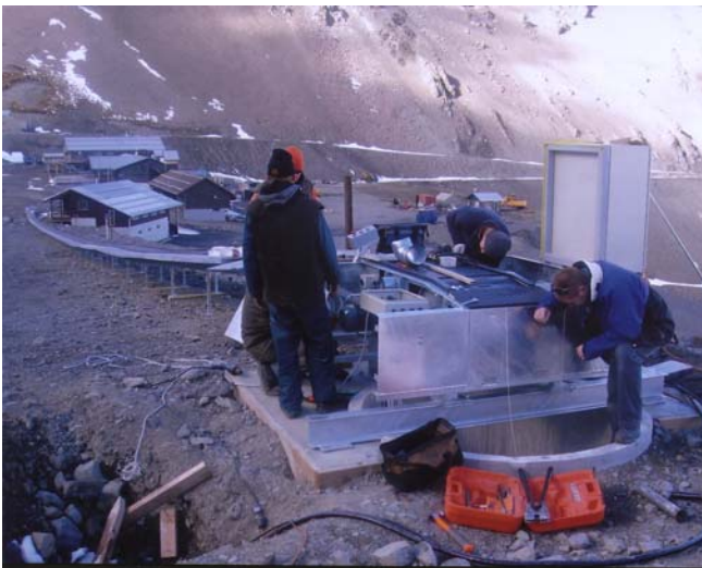
Magic Carpet installation – Mt Hutt