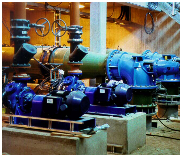
Sludge pipework – Bromley Wastewater Plant