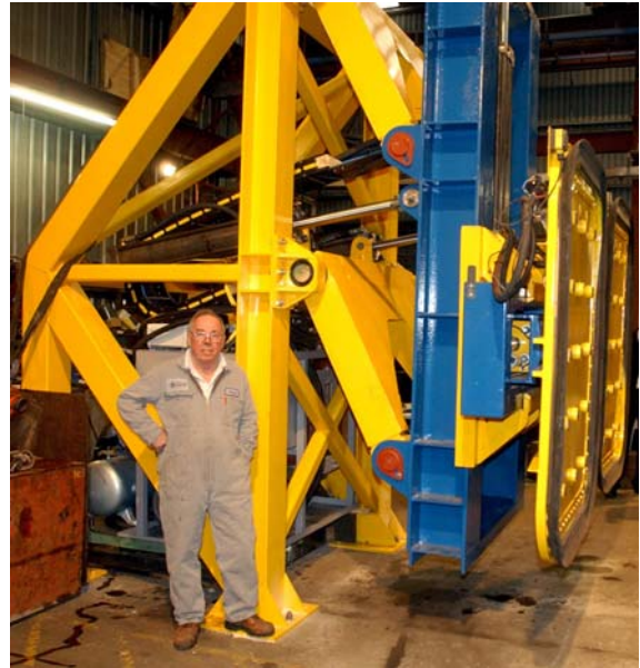
Wharf mounted ship mooring unit – Mooring Systems