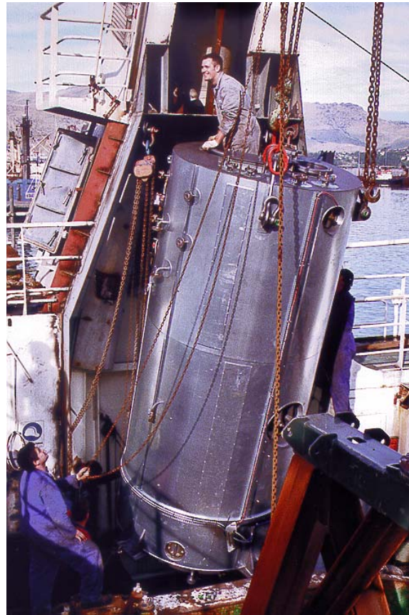
Boiler installation –Trawler Independent 1